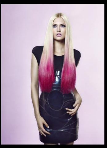
Great Lengths Hair Extensions